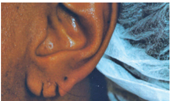
Before: Earlobe with Double Tear