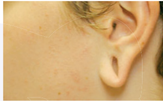
Before: Earlobe with Gauge